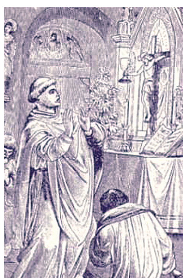
Antique print depicting the miracle