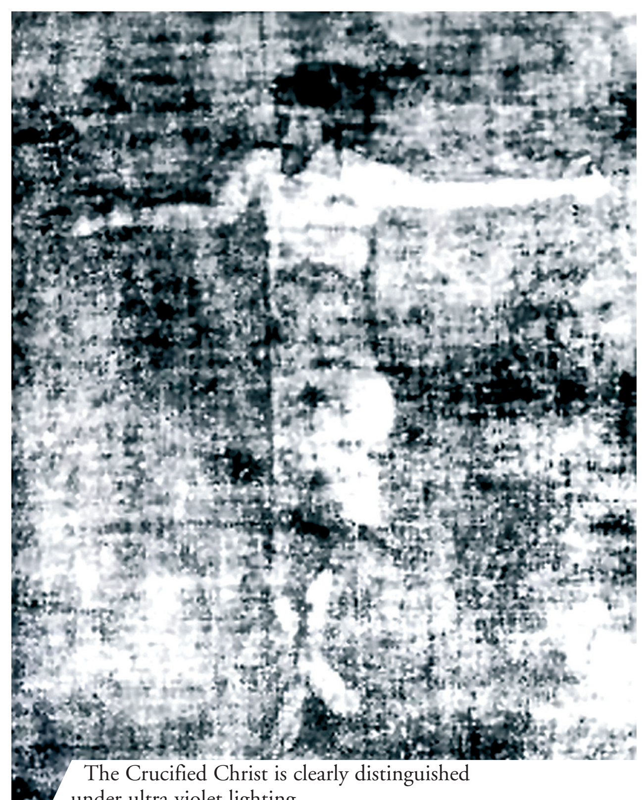
The Crucified Christ is clearly distinguished under ultra violet lighting

The actual basilica was constructed between 1698 and 1728 by Franz Lothar von Schonborn, the Archbishop of Mainz. In 1962, Pope John XXIII elevated the church to a minor basilica. Augustinian monks have protected the basilica since 1938.