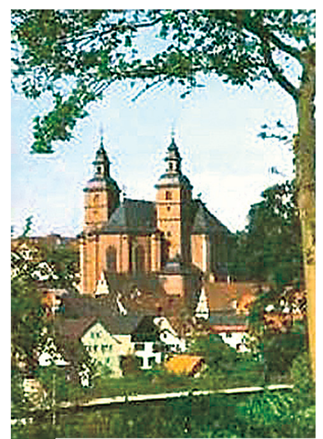
Church of Saint George