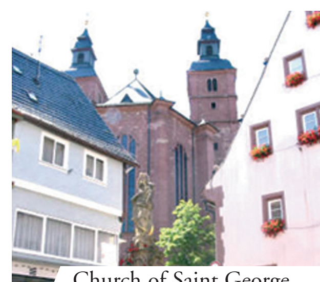
Church of Saint George