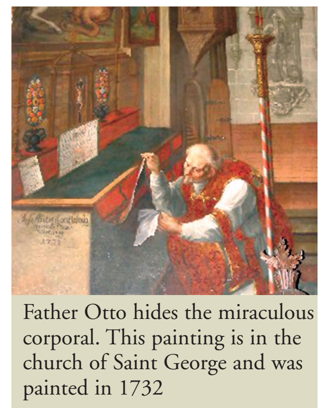
Father Otto hides the miraculous corporal. This painting is in the church of Saint George and was painted in 1732